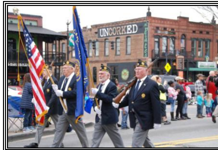
Color Guard marches in a local Parade