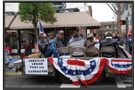
MLK Day Parade