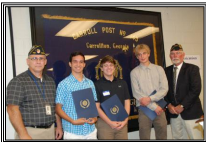
Boys State students receive Awards