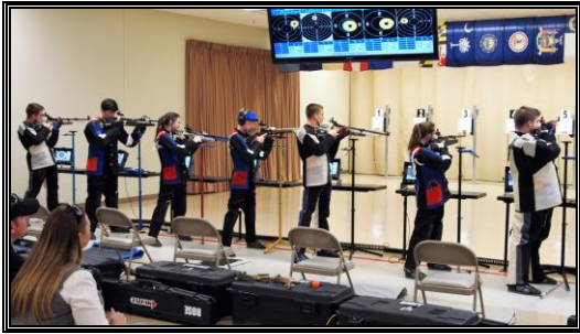
Post Sponsors Carrollton HS Riflery Team