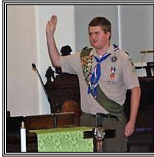
Eagle Scout Ceremony