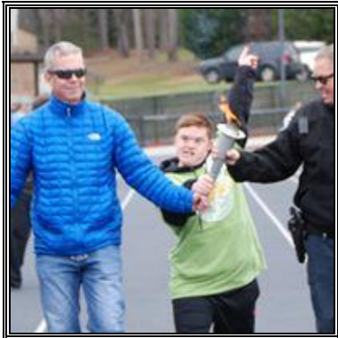
Special Olympics Torch Bearer