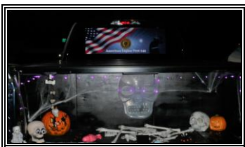
Trunk or Treat at 1 st Baptist Ch, Temple