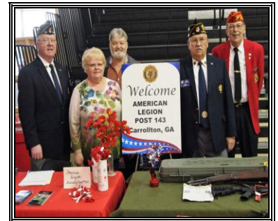
M1 Grand & AR15 Ticket Sales