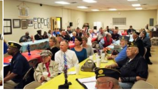
Post Family preparing for Thanksgiving Dinner